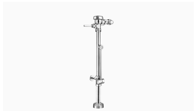
Variation Not Shown: Front of Valve Handle